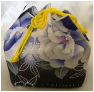
Blue and Black with Yellow Drawstring 65% Polyester, 35% Cotton About 6"H $16.50

Blue and White with Red Drawstring 65% Polyester, 35% Cotton About 6"H $16.50