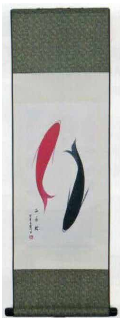
#ES4 Double Fish Rayon 37"L, 12"W $24.95 Made in China. Limited Quantity:1