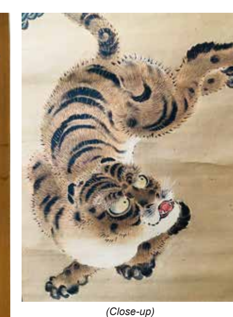
Tiger By Sogaku Kano 2yds2"L, 19.25"W $450.00 Secondhand Made in Japan Includes Wooden Box