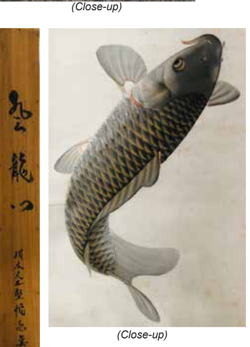
Black Koi 2yds8"L, 21.5"W $450.00 Made in Japan Includes Wooden Box