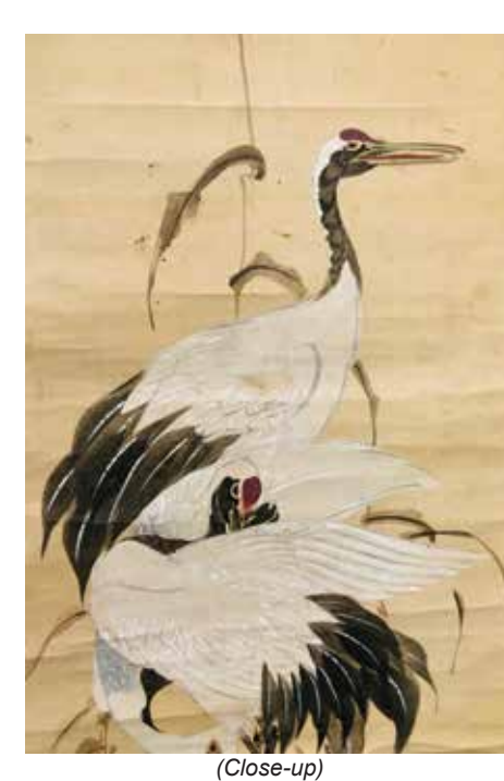
Tsuru 2yds4"L, 24"W $450.00 Secondhand Made in Japan Includes Box