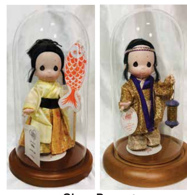
Glass Dome + 11"H, 5.5" Dia. Perfect Size for 9" Tall Precious Moments Doll Walnut Base $99.00 Oak Base $105.00 (Doll Not Included.)

Phone Orders Welcome. Reach us at (808)286.9964 or iidashonolulu@gmail.com We do Shipping. Free Expert Packing. Prices Subject to Change.