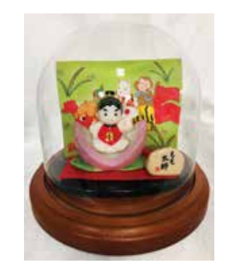
Glass Dome with Walnut Base 4"H, 4" Dia. $34.25 (Doll Not Included.)