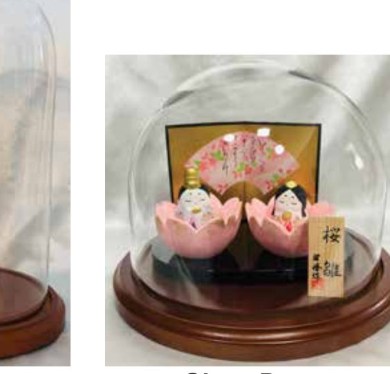
Glass Dome with Walnut Base 6.6"H, 8" Dia. $75.75 (Doll Not Included.)