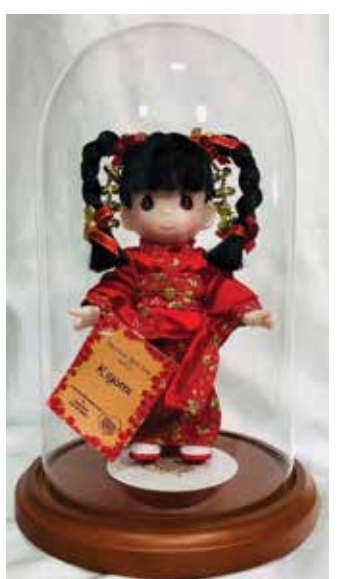
Glass Dome + 10"H, 5.5" Dia. Perfect Size for 7" Tall Precious Moments Doll Walnut Base $94.00 Oak Base $100.00