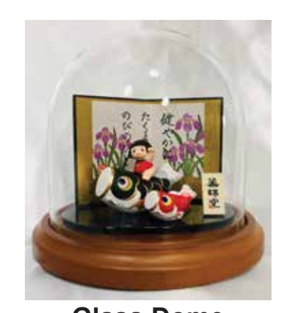
Glass Dome with Walnut Base 5.5"H, 5.5" Dia. $72.70 (Doll Not Included.)