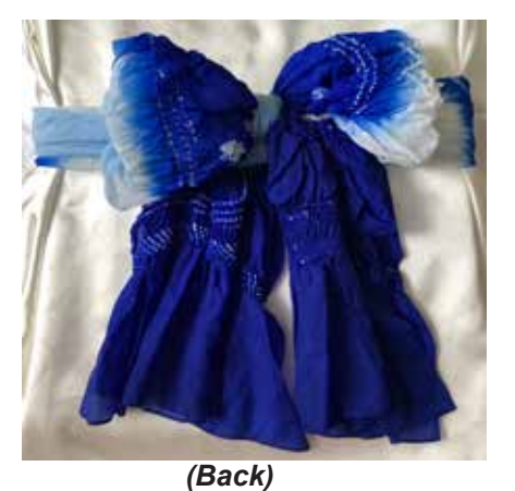
#0-10 Heko Blue, White 21"W, 3 yardsL $31.00