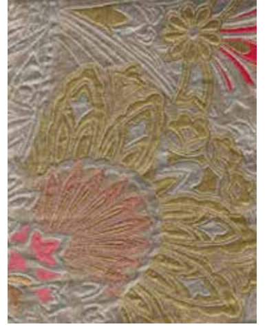
Abstract Floral Yellow and Orange on Beige 11.75"W $164.00