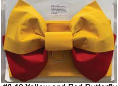
#0-12 Yellow and Red Butterfly 100% Cotton Cannot be Washed or Dry Cleaned $67.25