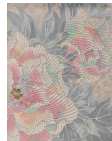
Pastel Pink Floral 12"W $164.00