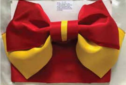
#0-19 Red and Yellow Butterfly 100% Polyester Cannot be Washed or Dry Cleaned $71.95

#4509 Fuschia and Royal Purple Reversible Obi 100% Polyester 6.75"W, 3 yards 29"L $78.80