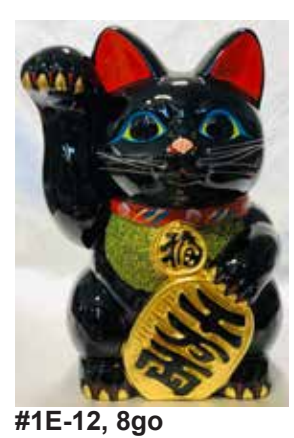
Black, Right Paw Coin Bank Made in Tokoname, Aichi Prefecture Koban says "Sen-man yen" to mean lots of money. Gold amulet says "Fuku" or Prosperity. 10"H, -"W, -"D $235.00 each