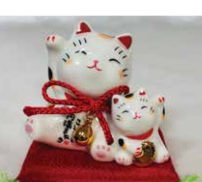
#7334 Miniature "Dakko" Neko Neko: 2.5"H, 2.75"W. Red Cushion: 3"x3" Dakko means Hug or Embrace Hiragana on cat says "Shiawase Koi Koi" or Welcome Happiness Kanji says "Enman" or Peace "Maneki" means Invite $30.65