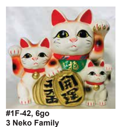
Coin Bank Made in Tokoname, Aichi Prefecture 3.88"H, 3.25"Dia. Koban in the front says "Kaiun" or Better Koban in the back says "Sen-man yen" to mean lots of money. Gold amulet says "Fuku" or Prosperity. 7.25"H, 7.5"W, 3.25"D