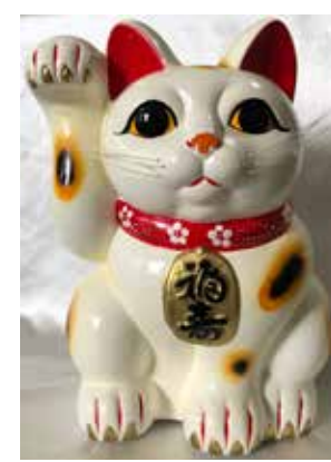
#1F-06, 10go White, Right Paw Coin Bank Made in Tokoname, Aichi Prefecture Gold amulet says "Fukuju" or Prosperity and Long Life.

Made in Tokoname, Aichi Prefecture Made in Tokoname, Aichi Prefecture Koban says "Sen-man yen" to mean lots of money Gold amulet says "Fuku" or Prosperity. 12"H