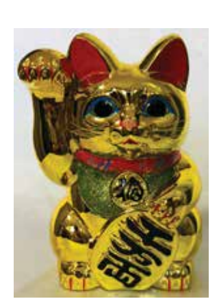
#1E-44, 8go Gold, Right Paw Coin Bank Made in Tokoname, Aichi Prefecture Gold neko is plated, not painted gold,

making it difficult to achieve its shiny luster. Koban says "Sen-man yen" to mean lots of money. Gold amulet says "Fuku" or Prosperity. 9.25"H, 6.25"W, 5"D $364.00 each