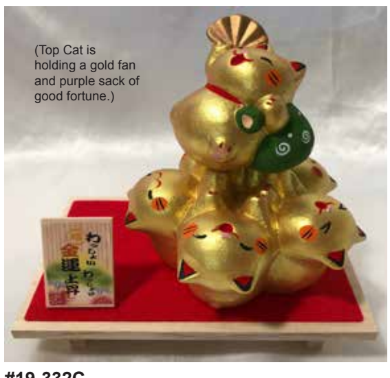
#19-332C Gold Cats Wasshoi Wasshoi means Heave-Ho! With Stand:5.5"H, 5.38"L, 3.75"W $37.95

Reach us at (808)286.9964 or iidashonolulu@gmail.com