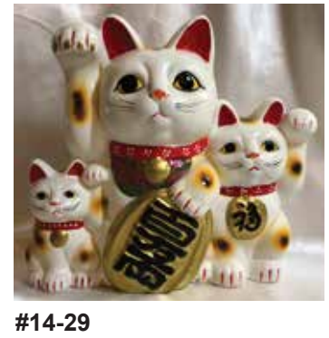
3 Neko Family Coin Bank Made in Tokoname, Aichi Prefecture Koban says "Hyaku-man yen" to mean lots of money. 6.75"H, 7.25"W, 3.5"D $98.00 each