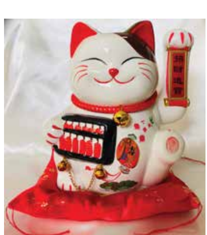
#JLC10-2 with Movable Arm Not a Coin Bank Ceramic Body, Plastic Arm 8.5"H "Invitation for Money and Wealth" *Made in China. 2AA Batteries Not Included.