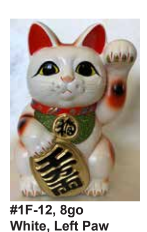
Coin Bank Made in Tokoname, Aichi Prefecture Koban says "Sen-man yen" to mean lots of money Gold amulet says "Fuku" or Prosperity. 9.5"H, 6.5"W, 5"D $149.25 each