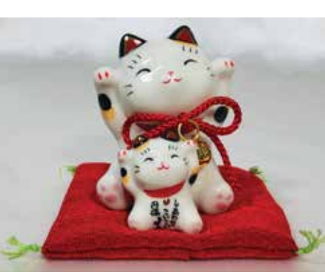
#7337 Miniature "Nakayoshi" Neko Neko: 2.5"H, 2"W Red Cushion: 3"x3" Nakayoshi means Good Friends Hiragana on cat says "Shiawase Koi Koi" or Welcome Happiness Kanji says "Enman" or Peace "Maneki" means Invite $30.65