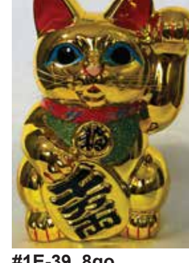
#1E-39, 8go Gold, Left Paw Coin Bank Made in Tokoname, Aichi Prefecture Gold neko is plated, not painted gold, making it difficult to achieve its shiny luster.

Gold neko is plated, not painted gold, making it difficult to achieve its shiny luster. Koban says "Sen-man yen" to mean lots of money. Temporarily Out of Stock