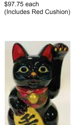
#14-24, 6go Black, Left Paw Coin Bank Made in Tokoname, Aichi Prefecture Koban says "Sen-man yen" to mean lots of money.