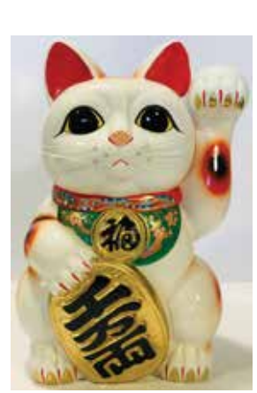
#1F-13, 10go White, Left Paw Coin Bank

Koban says "Sen-man yen" to mean lots of money Gold amulet says "Fuku" or Prosperity. 12"H $295.00