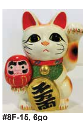
Neko with Daruma Coin Bank Made in Tokoname, Aichi Prefecture Koban says "Sen-man yen" to mean lots of money. 7"H, 5"W, 4"D $127.50 each