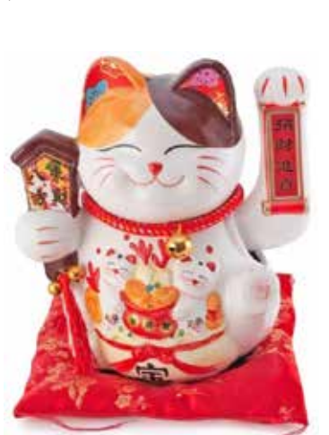
#JLC10-1 Lucky Cat with Movable Arm Lucky Cat Holding an Abacus Not a Coin Bank Ceramic Body, Plastic Arm 8.5"H "Invitation for Money and Wealth" *Made in China. 2AA Batteries Not Included.