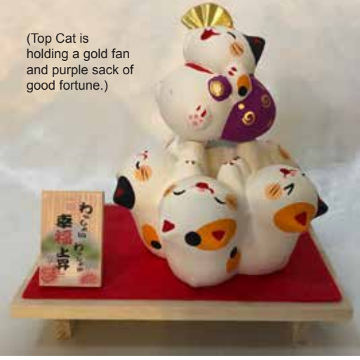
#19-331C White Cats Wasshoi Wasshoi means Heave-Ho! With Stand:5.5"H, 5.38"L, 3.75"W $37.95