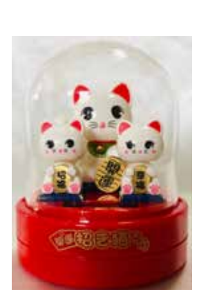
White, Solar Power Heads sway back and forth $49.00 each