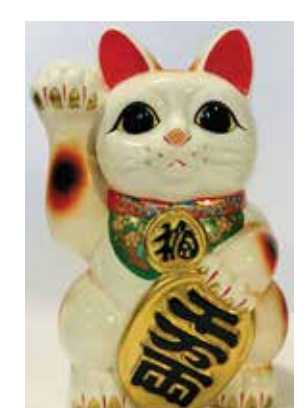
#1F-06 22-1, 10go White, Right Paw Coin Bank

Koban says "Sen-man yen" to mean lots of money Gold amulet says "Fuku" or Prosperity. 12"H $295.00