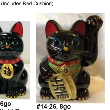
Black, Left Paw Coin Bank Made in Tokoname, Aichi Prefecture Koban says "Sen-man yen" to mean lots of money. Gold amulet says "Fuku" or Prosperity. 10"H, 6.25"W, 4.5"D $235.00 each