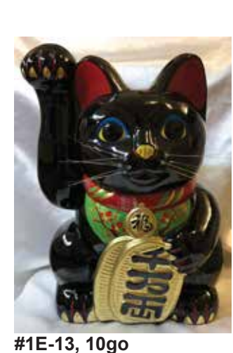
Black, Left Paw Coin Bank Made in Tokoname, Aichi Prefecture Koban says "Sen-man yen" to mean lots Gold amulet says "Fuku" or Prosperity. 13"H, 10"W, 7.5"D $310.00 each