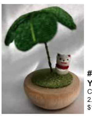
#40-361E Yurayura Roly Poly Cat under a 4-leaf Clover 2.5"H, 1.5"Dia. $15.00